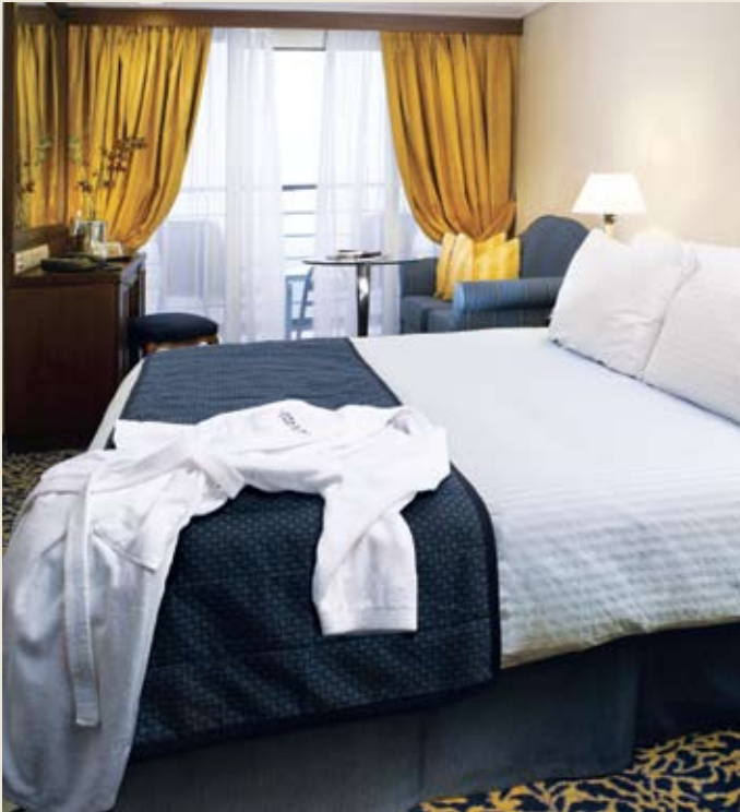
Concierge Level Stateroom