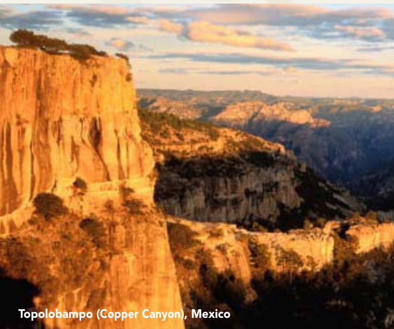
Topolobampo (Copper Canyon), Mexico

Abu Dhabi, UAE Fortaleza, Brazil Jerusalem (Ashdod), Israel Mazatlan, Mexico Sonora (Guaymas), Mexico Topolobampo (Copper Canyon), Mexico