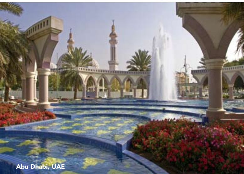
Abu Dhabi, UAE